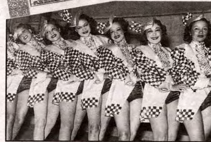
Clockwise: Amsterdam News front-page shows Apollo dancers won their strike. The Silver Belles, aged 84-96. Some of the Silver Belles in 1938, on tour with The Cotton Club Revue in South America.